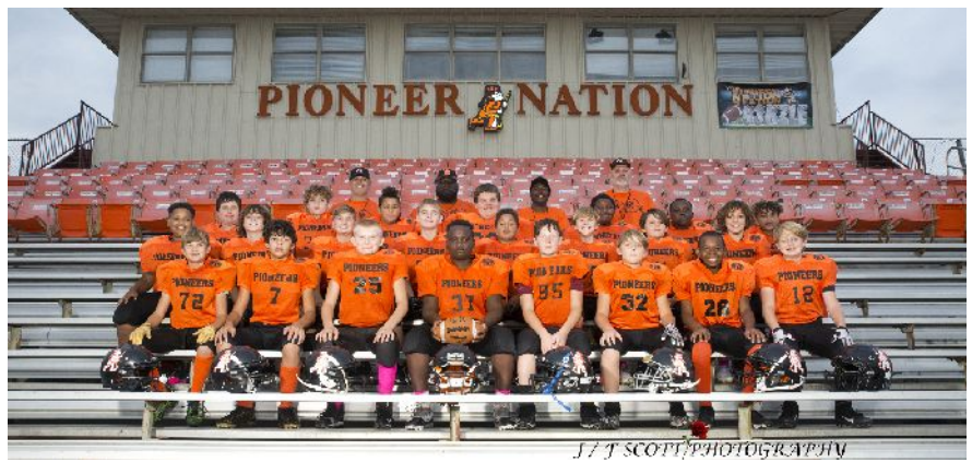
6 th Grade Kiwanis Pioneers