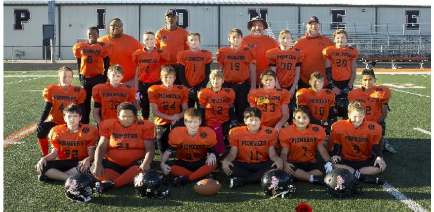
5 th Grade Kiwanis Pioneers