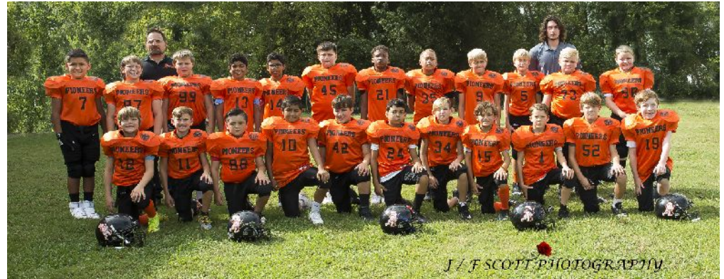
4 th Grade Kiwanis Pioneers